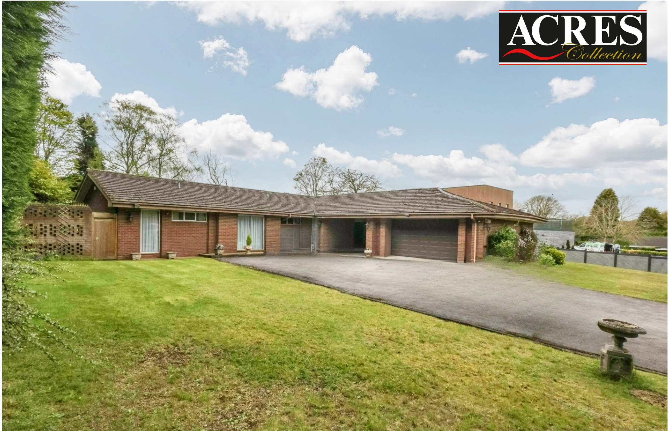
THE FIRS, 7 ROMAN PARK, ROMAN LANE, LITTLE ASTON, B74 3AF